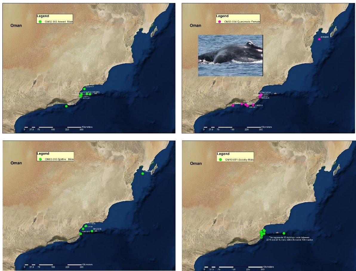
Figure 4 Maps of the sighting histories of the four ASHWs encountered during surveys conducted between March 2018 to April 2019: OM02-003 (top left), OM03-004 (top right), OM00-010 (bottom left) and OM10-001 (bottom right).

Blue whales were observed on three consecutive days during the April 2019 survey. The whales were located by visual observations of tall blows initially made from the cliff-top observation point above base camp. Photographs