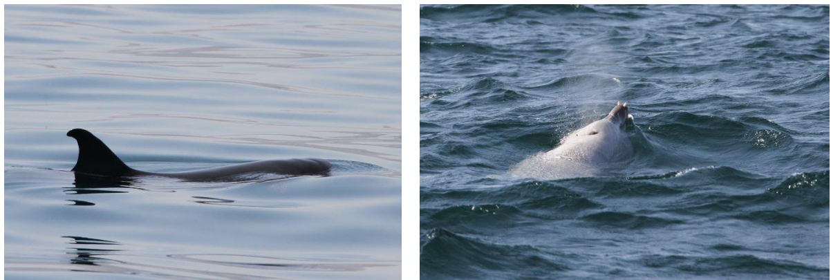
Figure 3 Photos of deep diving species encountered in the study area, Kogia sima (left) encountered on 3-April 2019 and Ziphius cavirostris (right) encountered on 9-March 2018.

Humpback whales were observed in the area during three of the surveys, and all included encounters with animals previously identified in the Oman humpback whale Photo-ID database (Table 3). Three of the four individuals were some of the most frequently encountered whales in the catalogue, with the vast majority of sightings having been documented in the Dhofar study site, and within 10km of the Hasik base camp (for example O10-001 was encountered on 29 occasions since its first sighting in the area in 2010). Figure 4 depicts the high site fidelity for these animals. ASHW song was detected on five occasions during the November 2018 survey and two faint detections in March 2018 and feeding was observed in the north of the study area in December 2018.