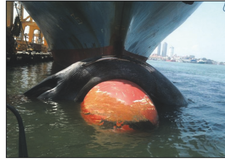
FIGURE 3: The blue whale draped on the bow of a ship.