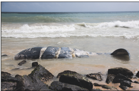
FIGURE 2: Posterior part of the blue whale.