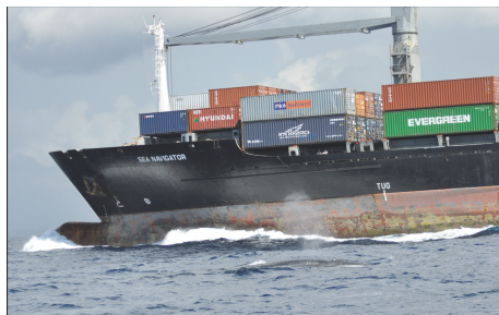
FIGURE 6: A Bryde's whale surfaces in close proximity to a cargo ship at Mirissa.

the relative abundance of this species in the sea lanes just off Sri Lanka. Moreover, blue whales in Sri Lanka typically make short, shallow dives [11, 12] and spend a relatively high proportion of their time feeding, socializing, and resting at the surface making them relatively more vulnerable to blunt trauma impacts.