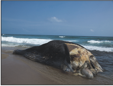
FIGURE 1: Anterior part of the blue whale.