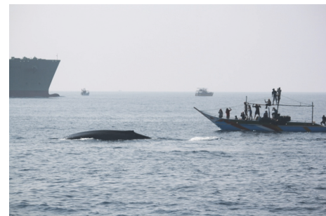
FIGURE 8: A blue whale off Mirissa, southern Sri Lanka, surrounded by boats and ships.

Nevertheless, the overwhelming number of live and dead reports involving blue whales indicates that they are the most heavily impacted species, at least in terms of absolute numbers. There is also a seasonal trend in strandings, with the highest number of reports occurring in August and November [13]. It is not clear to find so few collisions with great sperm whales ( n = 2 ) given their abundance in Sri Lankan waters. Also, the highest number of strandings of any great whale in Sri Lanka is that of the great sperm whale [13]. This species is most commonly observed in waters off northwest and northeast Sri Lanka, areas that are relatively light in ocean-going vessels, and this may explain the statistic. Collisions with Bryde's whales ( n = 1 ) were also rare, a surprise given the large number of sightings of the species in Sri Lankan waters. Are they able to sense the approach of vessels better than blue whales or are there behavioural characteristics that help the species avoid being hit?