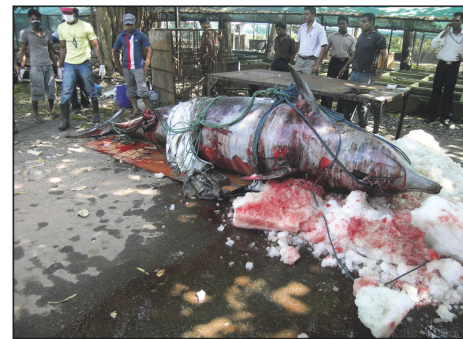
FIGURE 4: Cuvier's beaked whale.

was from Batticaloa. According to fishermen in the area, the animal had collided with a large vessel when surfacing. The carcass was fresh; it had its entrails protruding (Figure 4). A thorough necropsy was performed on the dead Cuvier's beaked whale. During our study from 2010 to 2014, a couple of live blue whales were observed with propeller mark on their bodies off the southern coast.